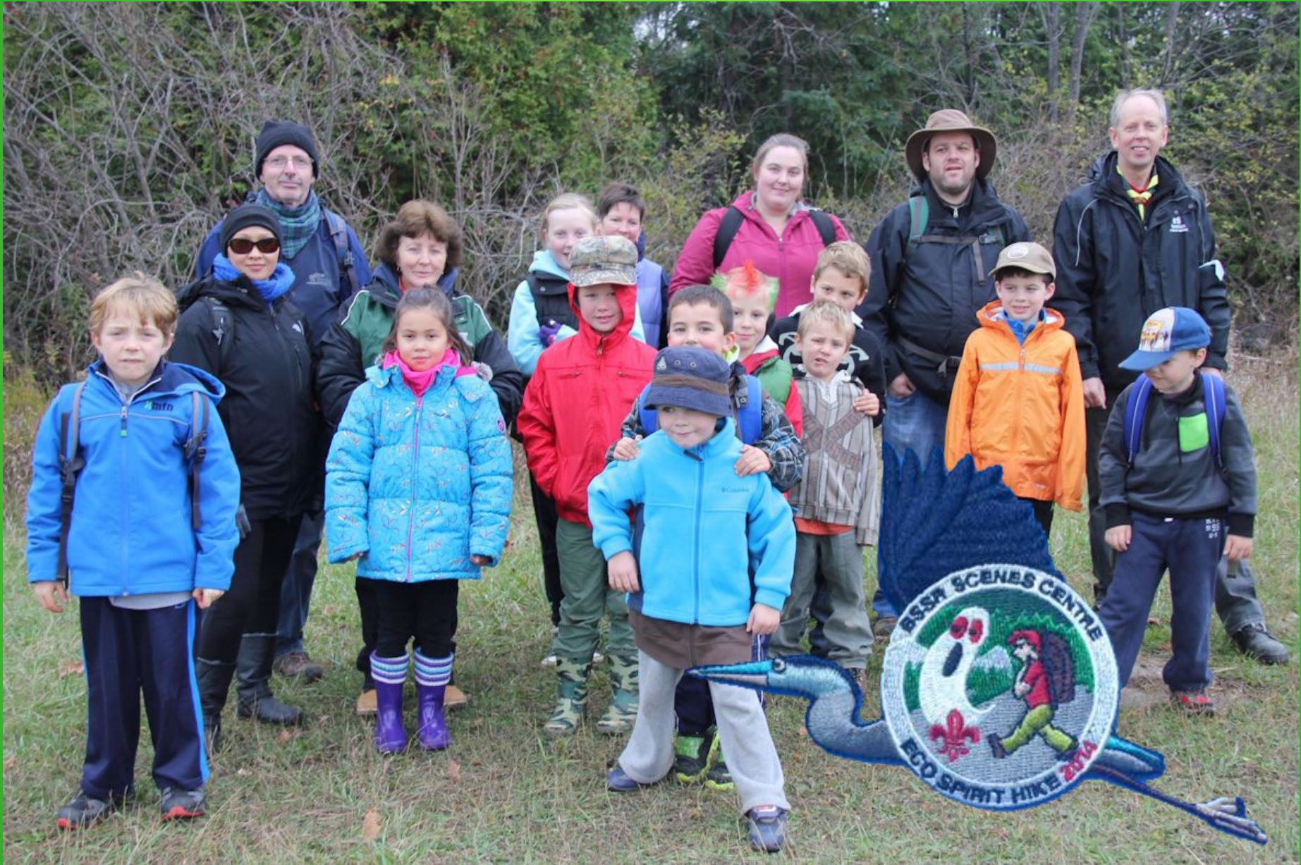
Eco Spirit Hike at Blue Springs Scout Reserve