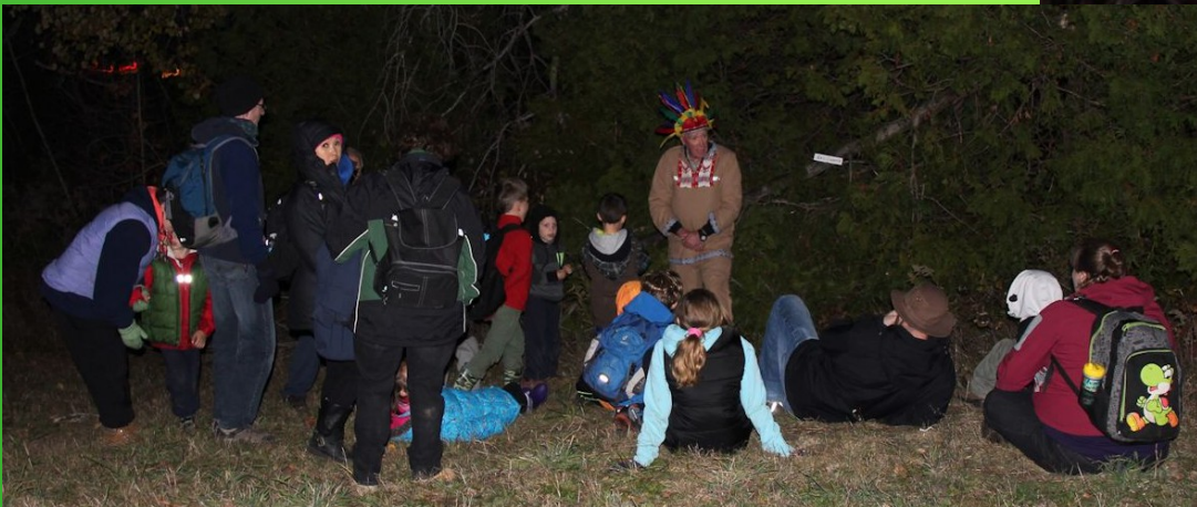
Eco Spirit Hike at Blue Springs Scout Reserve